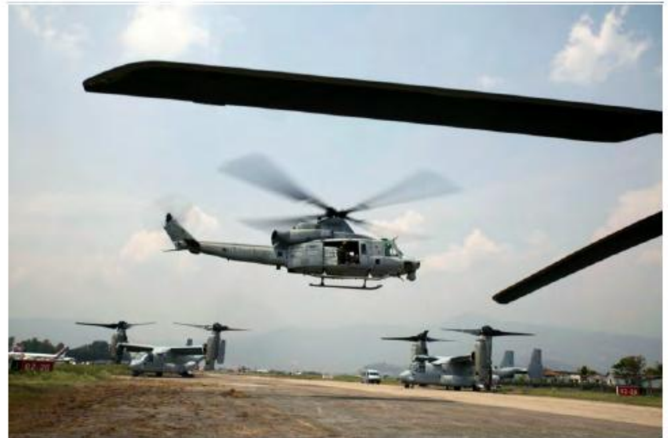
A UH-1Y Huey takes off carrying supplies from the Tribhuvan International Airport in Kathmandu, Nepal, May 7, 2015. Marine Light Attack Helicopter Squadron 469 Hueys have been assisting the Nepalese government to transport food, water, and shelter supplies to the Nepalese people in the rural areas of Nepal.